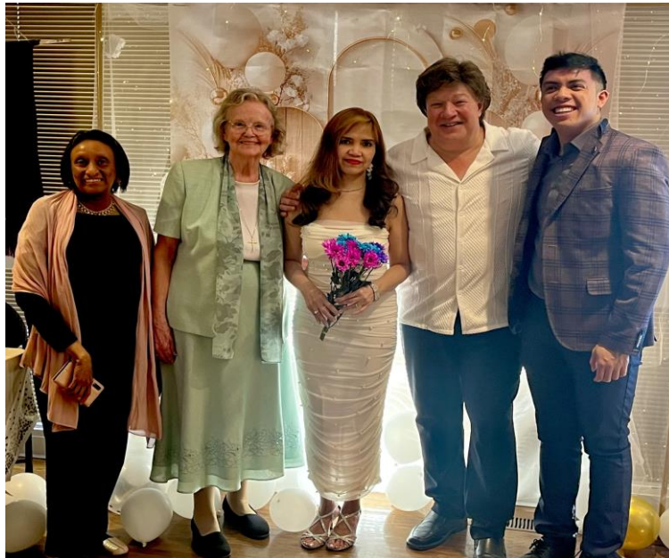
The Bridal Party